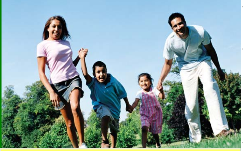
"Great opportunities to help others seldom come, but small ones surround us everyday." — Sally Koch

Providing outstanding customer service to birth parents, resource parents and community partners is a small way you can make a difference every day.