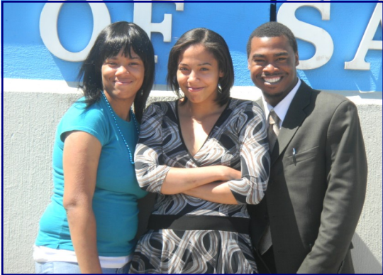
Our Youth Advisory Group