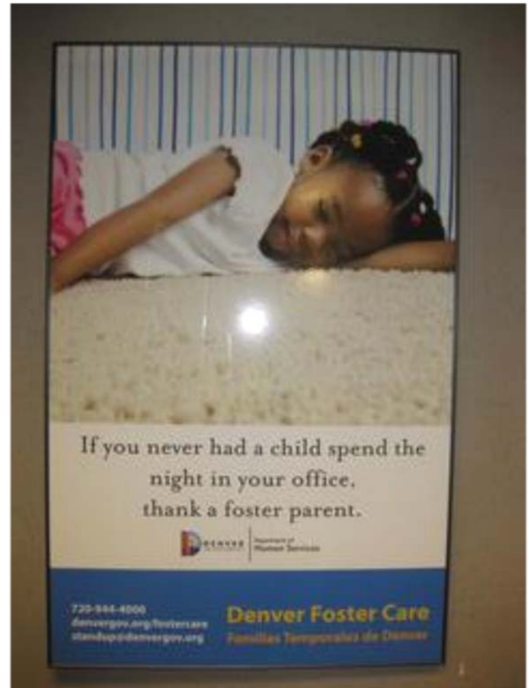
Denver's Village: Wrapping Families with Community Support