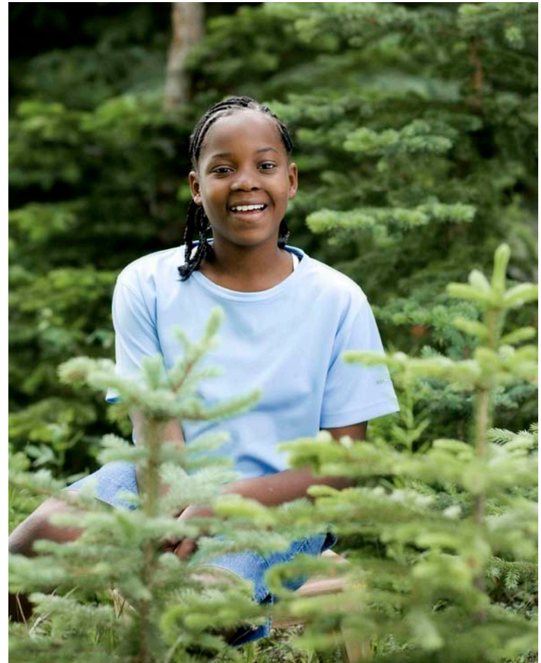
Denver's Village: Wrapping Families with Community Support